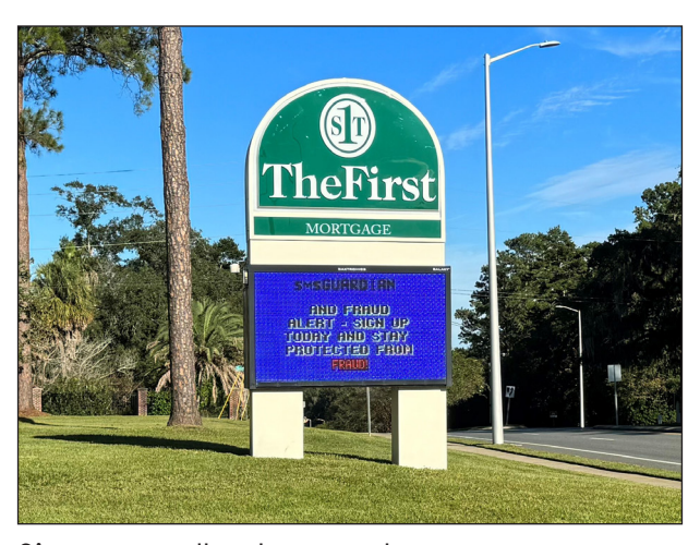
Sign on collector road