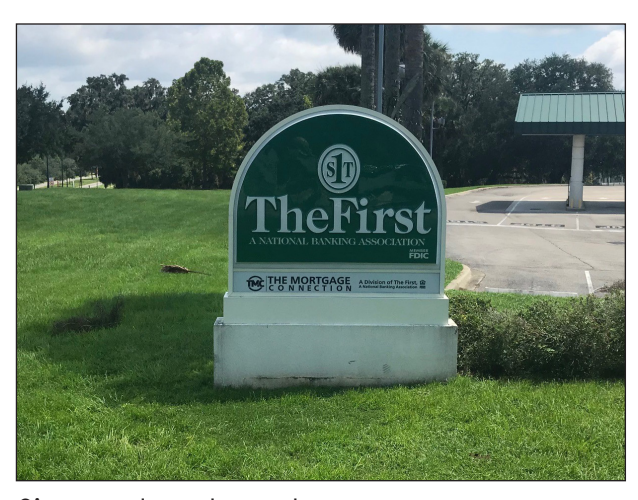
Sign on local road

example, a change of use from a shoe store to a mattress store is not an increase in intensity. Both uses are general retail. However, a change of use from office to restaurant is an increase in intensity, and such a change would be required to meet the development standards in the Neighborhood Compatibility Ordinance.